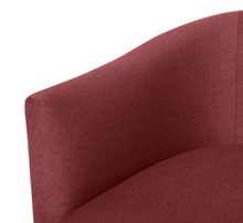
SINUOUS SPRINGS SUSPENSION