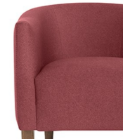
DOUBLE NEEDLE TOP STITCHING